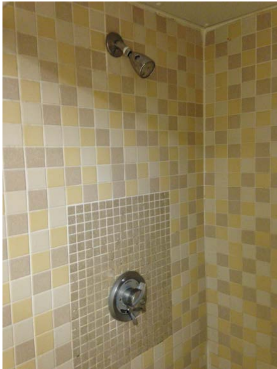
Original Alumni Shower Tiles with Repair