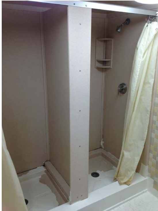
Alumni Shower – Eddy Hall