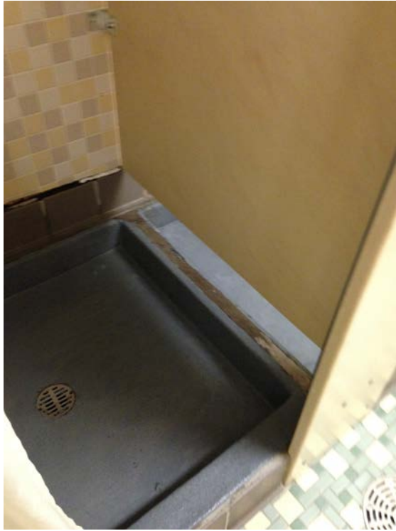
Alumni Shower Base – Older Style