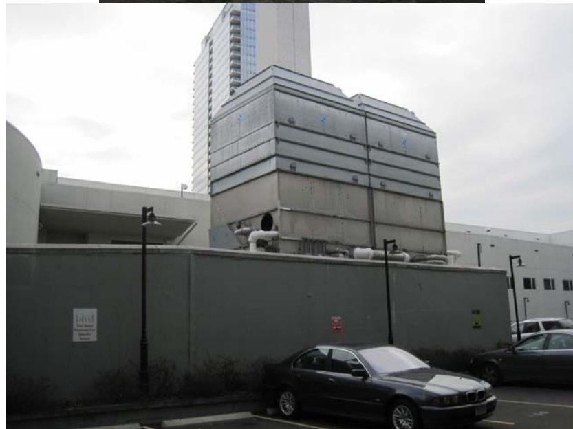
Stamford Cooling Towers